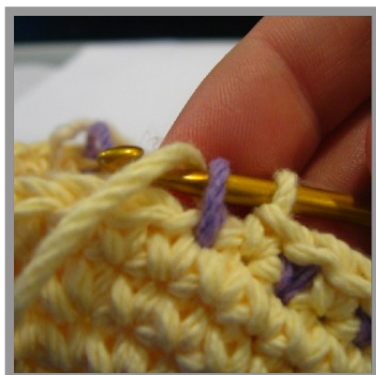
Step 3: use the main color to make the second loop of the sc