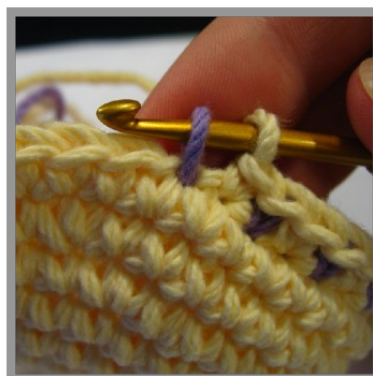
Step 2: pull through the first loop as if to make an sc with the second color.