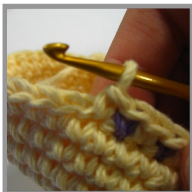
Step 1: sc 1 in main color.